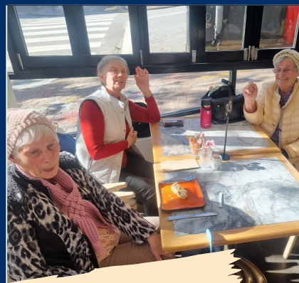
Bus trip to The Lock Up! Thursday 10/18/2025