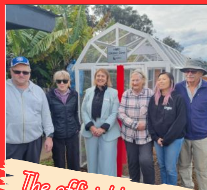
The official launch of HMC Garden's BRAND NEW Chicken Coop! 30/6/25