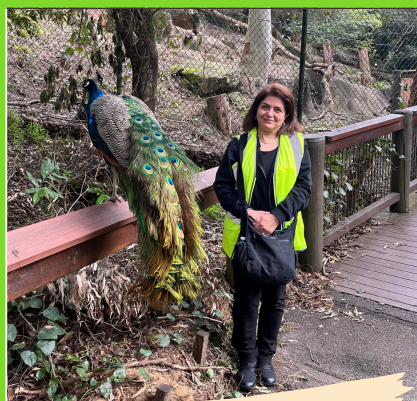
Monday Group at Blackbutt! 30/6/25