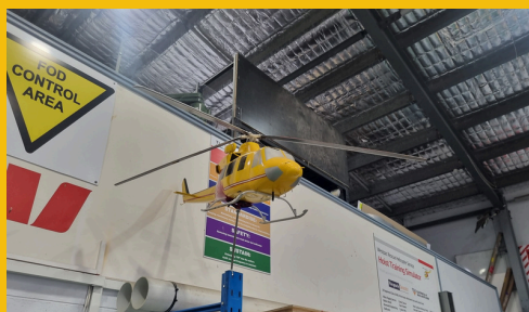
Bus trip to the Wespac Helicopter Rescue Base! 24/06/25