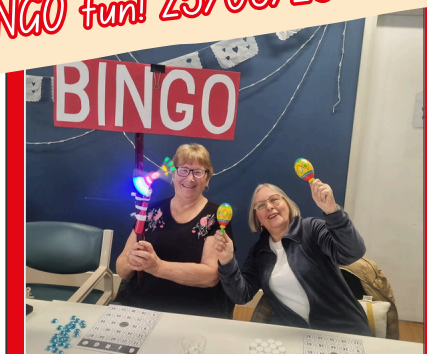
Our Wednesday Group enjoying some BINGO fun! 25/06/25