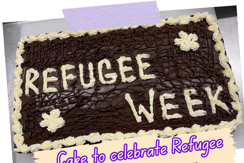
Cake to celebrate Refugee Week! 24/06/25