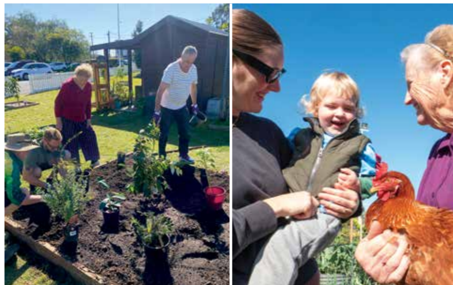
Thank you to our wonderful volunteers!

Sadly our bees had to go early in the year, but we have tried to remain positive and enjoy meaningful activities such as the John Hunter Mental Health Group attending the garden again this year.