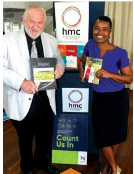
Elsa's book "Freedom to Belong" is available to purchase at the HMC office for $25.

The Multicultural Pop Up Library is a partnership of Hunter Multicultural Communities and Newcastle Libraries – the monthly program provides the community with more multilingual and multicultural resources.