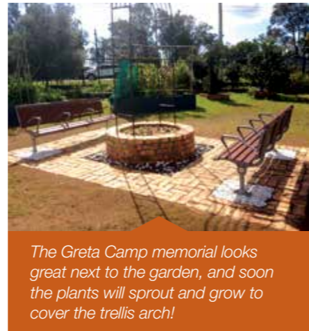
The Greta Camp memorial looks great next to the garden, and soon the plants will sprout and grow to cover the trellis arch!

The Greta Camp Memorial was a little hectic because the bricks had to be obtained from that area and while it was a challenge it ended