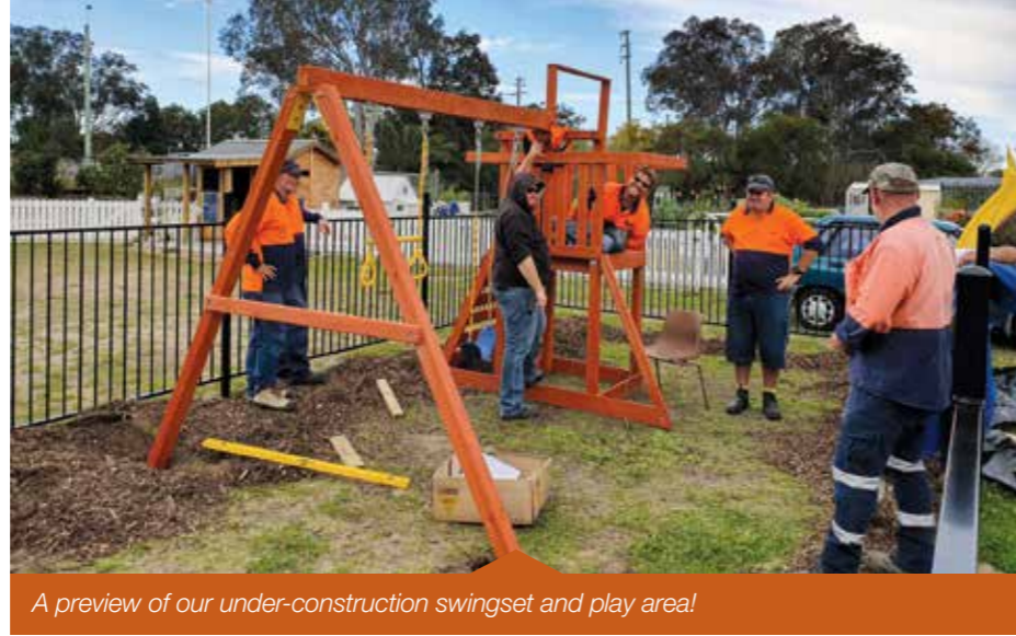
A preview of our under-construction swingset and play area!

They have also moved the water pump which waters the gardens. The pump had come away from where it had been previously and was more or less waving in the breeze, which has caused the