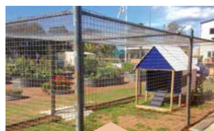
Our chicken coop is looking great thanks to the Work for the Dole boys and girls. Now we just need some chickens for it!

Seeing as I have been flat out making lots of jams of late, and strawberries have been very cheap in the shops, here is my recipe for rhubarb and strawberry jam. It's great to have on scones and pikelets or fill little cooked pastry cases with a dab of whipped cream.